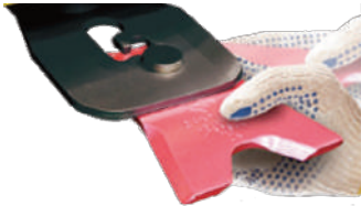
Quick Change Blades

This model comes as standard with tool-less Quick Change blades and has a comfort seat model, offering the same features, with the addition of a larger comfort seat.